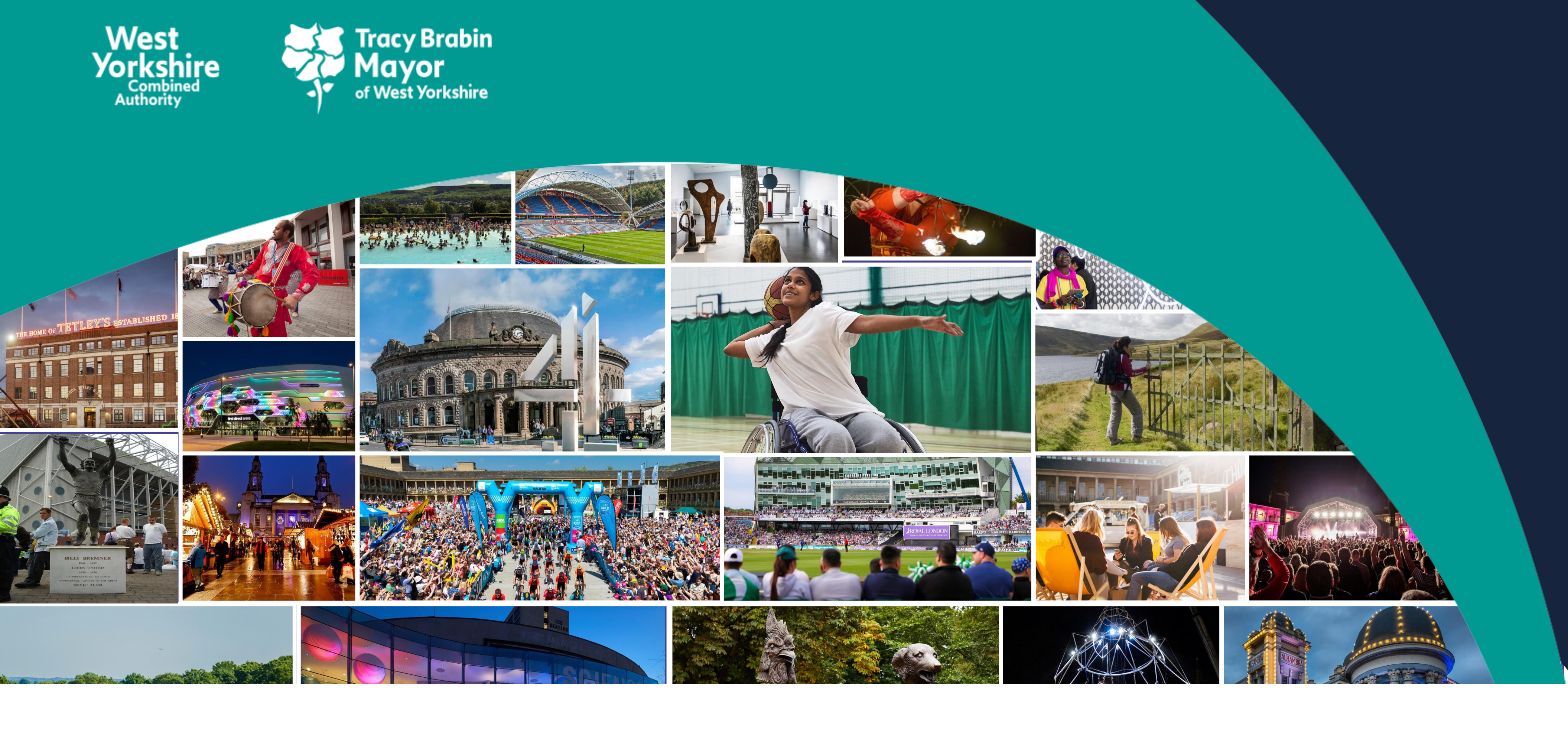
Culture, Heritage and Sport Framework